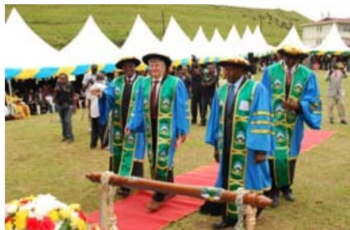
6th Graduation ceremony with chief guest the Ambassador of the Kingdom of Belgium