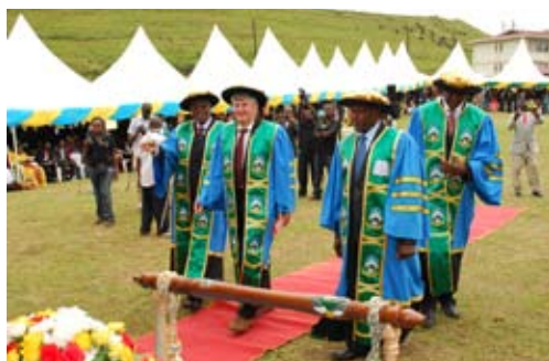
6th Graduation ceremony with chief guest the Ambassador of the Kingdom of Belgium