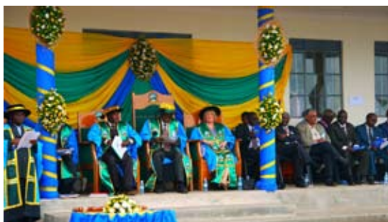
5th Graduation ceremony at the newly opened building of SHS (Lake Saaka Campus), with chief guest the Ambassador of the Republic of Ireland.