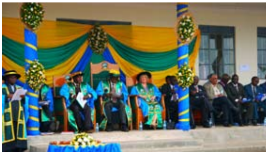
5th Graduation ceremony at the newly opened building of SHS (Lake Saaka Campus), with chief guest the Ambassador of the Republic of Ireland.